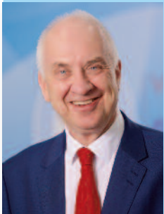
Police and Crime Commissioner David Jamieson

Since 2010, West Midlands Police has lost over £145m and more than 2,000 police officers. I have been very clear that the government needs to begin to take the safety of our communities seriously by increasing the funding to the police.